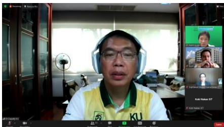
Image2 Opening Ceremony2