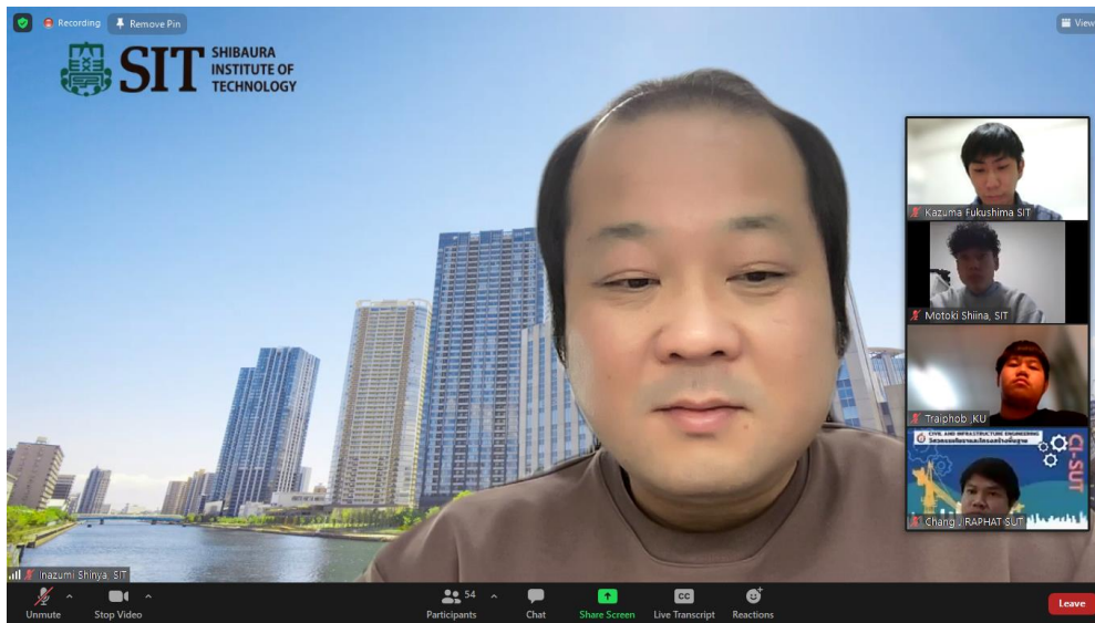
Image1 Opening Ceremony1

A global PBL was held online by ZOOM under the theme of “Next-Gen Civil Engineering”.