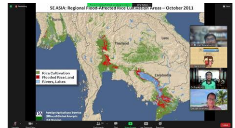
Image4 Special Lecture1