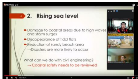
Image6 Final Presentation