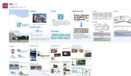
Image6 Scene for Final Presentation