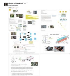
Image7 Scene for Final Presentation