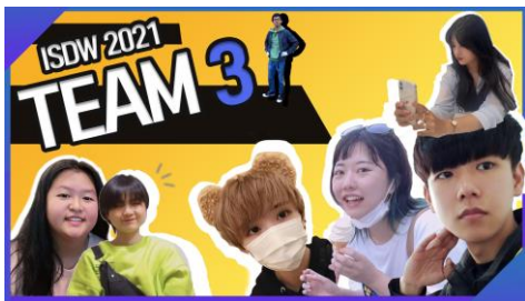
Image2 Team 3 workshop Activity Photos

The International Summer Design Workshop (ISDW) has been held annually since 2008. University students from multiple countries in the Asia Pacific region collaborate with each other to create a design proposal. Through this, students develop: design skills communication skills intercultural awareness