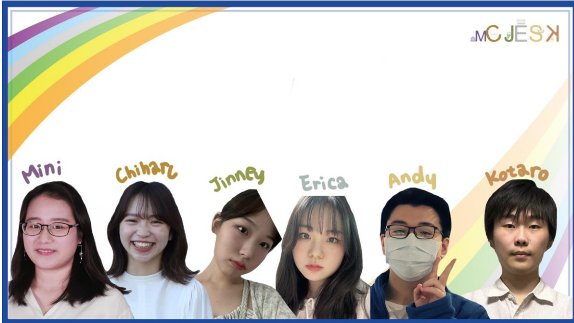
Image1 Group photo of the final presentation

ISDW is about having open hearts and open minds. By bringing people open to new ideas together to share and collaborate, we can learn new perspectives and understand each other better, ultimately leading to global friendships and a more peaceful world. This year, 52 students and 6 faculty members from 5 universities in 4 countries participated in the workshop, which was held online for 8 days from August 22 to 29, and we had lively discussions every day until late at night, resulting in excellent proposals.