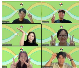
Image3 Greetings after grouping