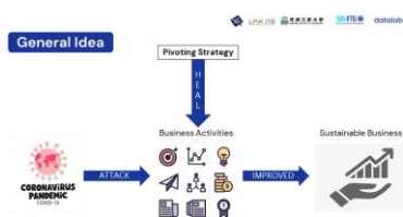
Image2 PBL Concept

In Global PBL which we held from March 15 to March 26, 2021, we formed a mixed team with students from the Department of Business Management of Bandung Institute of Technology to provide online business consulting services to eight start-up companies in Bandung. In the consulting, we used systems engineering methods such as quantitative data analysis. Through this gPBL, we fostered students' global perspectives and gave them the experience of cooperating with people in other countries to develop system-thinking engineers who can be active in the world. In addition, the students experienced the importance of communication through collaborative work with multiple people.