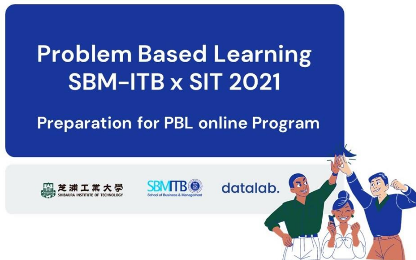
Image1 PBL Explanation

In Global PBL which we held from March 15 to March 26, 2021, we formed a mixed team with students from the Department of Business Management of Bandung Institute of Technology to provide online business consulting services to eight start-up companies in Bandung. In the consulting, we used systems engineering methods such as quantitative data analysis. Through this gPBL, we fostered students' global perspectives and gave them the experience of cooperating with people in other countries to develop system-thinking engineers who can be active in the world. In addition, the students experienced the importance of communication through collaborative work with multiple people.