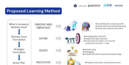
Image4 Consulting Method