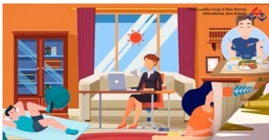
Image2 Biodegradable materials from gabadge

15.30 – End (West Indonesia Time) / 16.30 – End (Taipei Time) / 17.30 – End (JST)