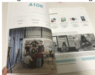
Image6 Workshop deliverables