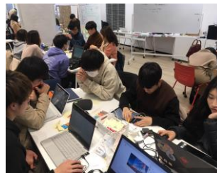
Image3 More detailed design work