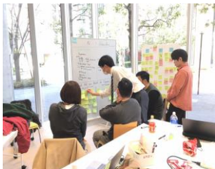
Image2 Affiliated high school students also participated

This gPBL is hold every year in early February, Shibaura Institute of Technology, Tokyo City University, Chiba Institute of Technology and Kookmin University from Korea. For this year, We conducted Design Workshop about AI (artificial intelligence) + multiple keywords for 8 days (entertainment, education, fashion, movement, watching games, etc.) and drawing a vision of the future. In total, 80 over students from both countries were made into 13 groups and worked for more than a week to make good ideas. There were so many interesting and feasible designs. The 1st to 3rd award groups will enter the international competition with the Korean Design Society.