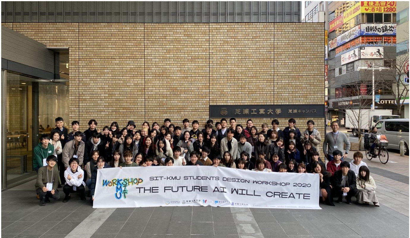
Image1 Group photo of all participants

This gPBL is hold every year in early February, Shibaura Institute of Technology, Tokyo City University, Chiba Institute of Technology and Kookmin University from Korea. For this year, We conducted Design Workshop about AI (artificial intelligence) + multiple keywords for 8 days (entertainment, education, fashion, movement, watching games, etc.) and drawing a vision of the future. In total, 80 over students from both countries were made into 13 groups and worked for more than a week to make good ideas. There were so many interesting and feasible designs. The 1st to 3rd award groups will enter the international competition with the Korean Design Society.