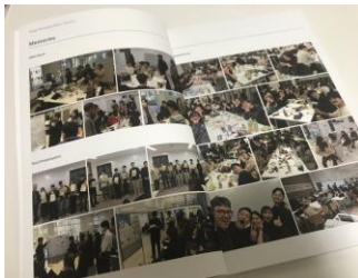
Image5 Workshop deliverables