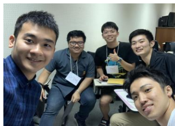
Image3 Your name tag is a nickname!