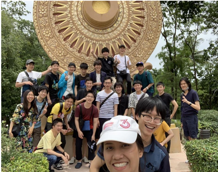
Image1 Understanding Thai culture at the weekend

The global Project-based learning (PBL) program in the department of Materials Science and Engineering has been conducted at Chulalongkorn University (CU) in Thailand from July 30th to August 12th, 2019. The student from SIT and CU were joined in the program. The aim of the program is to work with foreign students to solve problems, and to improve practical skills and global communication skills. Therefore, our program emphasized the collaboration with foreign students majoring in material engineering, and also the discussion with a small group, increasing learning effect. The contents of program included the PBL, academic English trainings, special lectures, factory tours, and internship at company.