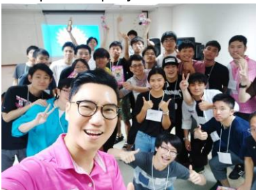
Image2 At the English class (during the PBL)

The global Project-based learning (PBL) program in the department of Materials Science and Engineering has been conducted at Chulalongkorn University (CU) in Thailand from July 30th to August 12th, 2019. The student from SIT and CU were joined in the program. The aim of the program is to work with foreign students to solve problems, and to improve practical skills and global communication skills. Therefore, our program emphasized the collaboration with foreign students majoring in material engineering, and also the discussion with a small group, increasing learning effect. The contents of program included the PBL, academic English trainings, special lectures, factory tours, and internship at company.