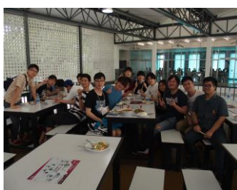
Image5 Lunch at the school cafeteria