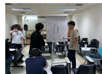
Image7 Scene of PBL implementation