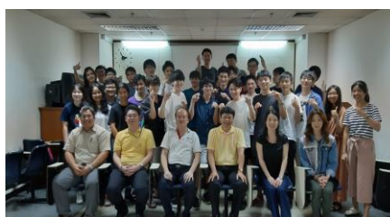
Image6 Group photo