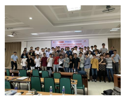
Image4 Group Photo