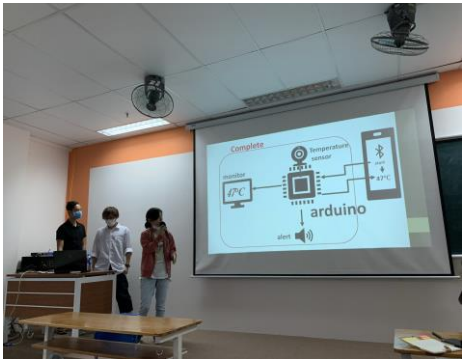
Image3 Final Presentation