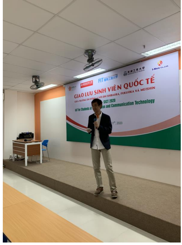
Image1 Opening Talk

This gPBL program consists of four different universities from Japan(SIT, FIT), Vietnam(Dona) and Taiwan(Ming chi).