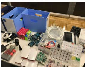
Image3 Devices for PBL