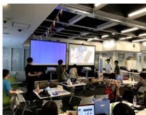
Image2 Final Presentation 1

We held a joint global PBL program with Hanyang University (HYU). In this program, SIT and HYU students participated to develop a networked applications/systems in each group. First, participants discussed an idea which includes a network function and made a proposal. After that, each group started to develop the proposal with each group to combine various sensors, switches, and other technologies such as machine learning and deep learning. Finally, each group finished to develop the proposal and gave the presentation and demonstration about the proposal as one of the events of the open campus in SIT. All the participants have improved the communication skills via the international activities and have learned the practical skills to combine the various technologies using network through participating the program.