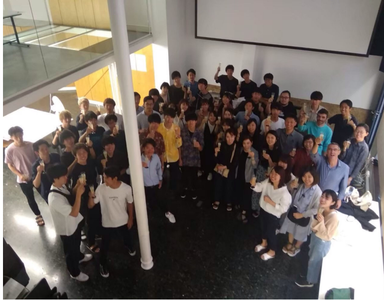
Image1 The completion ceremony

Forty two students in the second year of SA course and four teaching assistants participated in the three-weeks architectural design program at Barcelona Architectural Center (BAC) located in the center of Barcelona. The focus of the program was to design a place for the residents and visitors in the old city area. Beside the project, the students visited a number of old and new buildings in Barcelona every morning before their studio esquisse in the afternoon. They also visited the architecture by Antonin Gaudi and RCR as a day trip which was held on every weekends. Through their experience on various architecture, they could develop their ability of design with deeper understanding of history, landscape and city.