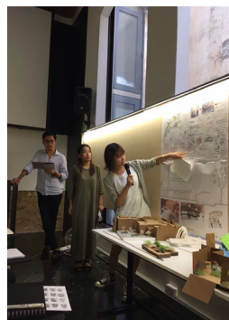
Image3 Fanal Presentation