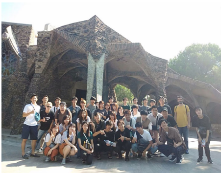
Image2 @Colonia Guell by Antoni Gaudi

Forty two students in the second year of SA course and four teaching assistants participated in the three-weeks architectural design program at Barcelona Architectural Center (BAC) located in the center of Barcelona. The focus of the program was to design a place for the residents and visitors in the old city area. Beside the project, the students visited a number of old and new buildings in Barcelona every morning before their studio esquisse in the afternoon. They also visited the architecture by Antonin Gaudi and RCR as a day trip which was held on every weekends. Through their experience on various architecture, they could develop their ability of design with deeper understanding of history, landscape and city.