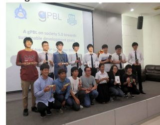
Image7 Presentation awards