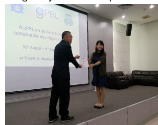
Image6 Giving certificate