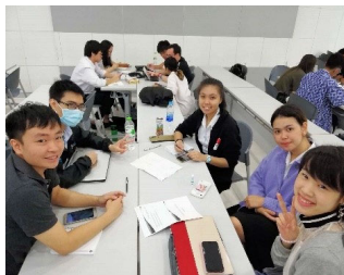
Image2 Theme discussion

As a whole, this AgPBL was successful and the participants achieved their goals as well as brushing up their English communication skills.