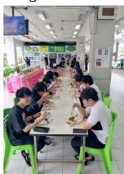
Image5 Farewell party