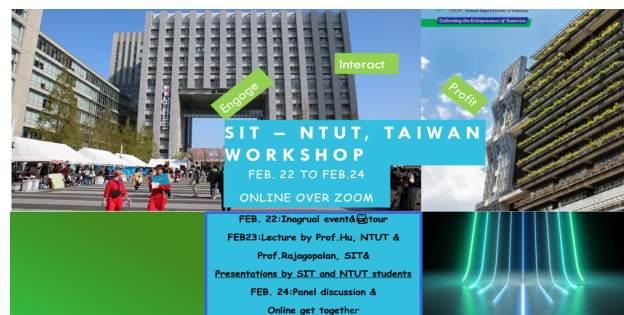
image3 gPBL Opening