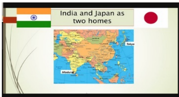
Image2: Prof.RAJAGOPALAN Presentation

As the students spoke over virtual media, I felt they were less intimidated by the environment and this could become a valuable platform for students to test their speaking and exchange skills. Compared to physical face-to-face exchanges, monetary wise also, we could profit a lot from these virtual exchanges. Of course, face-to-face has the benefits of introducing students to a new environment and real interactions, which we need once the Covid-19 outbreak is over. Even then the virtual platform exchange could still be a valuable tool for expanding our mutual international collaboration and standings. Post survey revealed large appreciation and satisfaction of the event from the participants from both SIT and NTUT. We plan to organize future events both online as well face-to-face if possible next fiscal year during the end of Feb 2022.