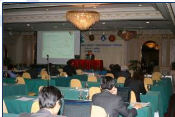
1 st SEATUC Symposium, Feb. 2007 in Bangkok, Thailand

December 10 th , 2007 : Deadline for submission of final papers