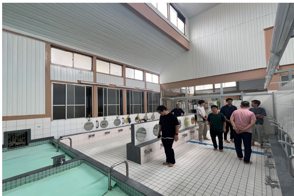
Visit to a public bathhouse (sento)

From June 20 to 30, 2024, Shibaura Institute of Technology, the National University of Singapore, and Tokyo University of Science jointly hosted an international workshop. While Tokyo once had a large number of public bathhouses (sento), their numbers have declined to about one-fifth of the peak levels seen in 1968. In response to this cultural shift, the workshop focused on the design of new sento facilities as a way to revitalize the declining bathhouse culture. Students were divided into six interdisciplinary groups, composed of participants from all three universities, and tasked with designing proposals for sento located in the Adachi and Sumida wards. The final presentations were delivered on the last day of the workshop. Throughout the event, faculty members and guest lecturers provided expert insights, offering participants a valuable opportunity to deepen their knowledge and engage with the cultural and architectural challenges posed by the sento tradition.