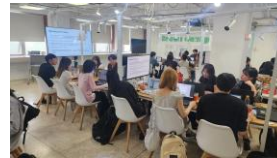
Group Work 2