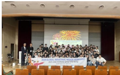
University of Ulsan Opening Ceremony