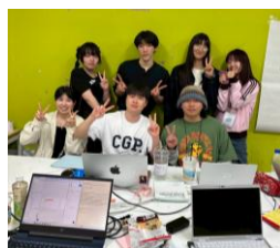
Group Work 2