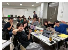
Group Work 1