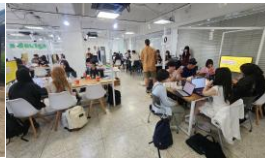
Group Work 1