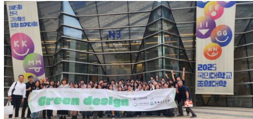
Opening Ceremony . Group Photo

From May 22 to June 2, 28 students and 4 TA from Kookmin University and the University of Ulsan in Korea participated in gPBL. At Kookmin University, we worked with 32 students for five days on the theme of "Circular Design," from group formation, field surveys, and idea meetings, to conceptualization, visualization, and presentation preparation. At the University of Ulsan, we were divided into 10 groups of 35 students and engaged in the same design process under the theme of "Emotional Sharing. It was a good stimulus for both sides.