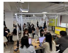
Group Work 3