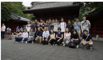
Image2 at Akamon of Tokyo Univ.

Nearly 20 students from multi-universities of Beijing joined this 9 days global PBL. At the weekend, they visited science museums, learned the developing history of science and technology, and realized that science and technology are very important in changing our society and life. In the weekdays, they visited the laboratory in Shibaura Institute and Technology, saw the research equipment which they seldom touched in their study. They also joined the lectures given by professors from SIT, and learned the basics about material engineering. They had a wonderful experience in SIT and hope to visit again. The students from SIT had a good chance to introduce their researches and the Japanese cultures to the abroad students in English. They made a very nice communication with each other.